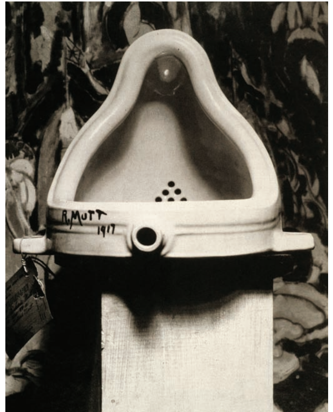
Figure 1: Fountain by Marcel Duchamp. The 1917 original, a urinal signed R. MuTT, can only be seen as replicas in museums today.

When discussing a work of art, many notable critics and artists will refer to its intensity , the quality of having great energy, strength, depth or emotional force. For example, critic Robert Hughes speaks of the intensity as a "Whitmanesque" quality where the work inhales the world around it. Intensity can be expressed in both content and in form, so let us further define some of the traits