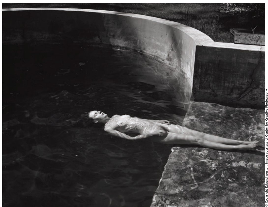
Figure 3: Nude Floating, 1939, by Edward Weston. Silver gelatin print, 8" x 10". Collection of the Center for Creative Photography.

contrast let us take another look at Picasso's The Family of Saltimbanques. (See Figure 2.) Look at how Picasso adds complexity to Saltimbanques by changing the value contrast throughout the work. Overall, the composition has a rather low value contrast level, casting the figures in an ethereal haze. However, not all value contrasts are the same throughout the painting. The highest value contrast is reserved for Picasso and the lowest value contrast is reserved for Olivier — and for good reason. The act of Olivier sending the child away is distancing her from Picasso. Olivier is dissolving in this painting as though she were in the background, but she is, in fact, in the foreground — the last place that