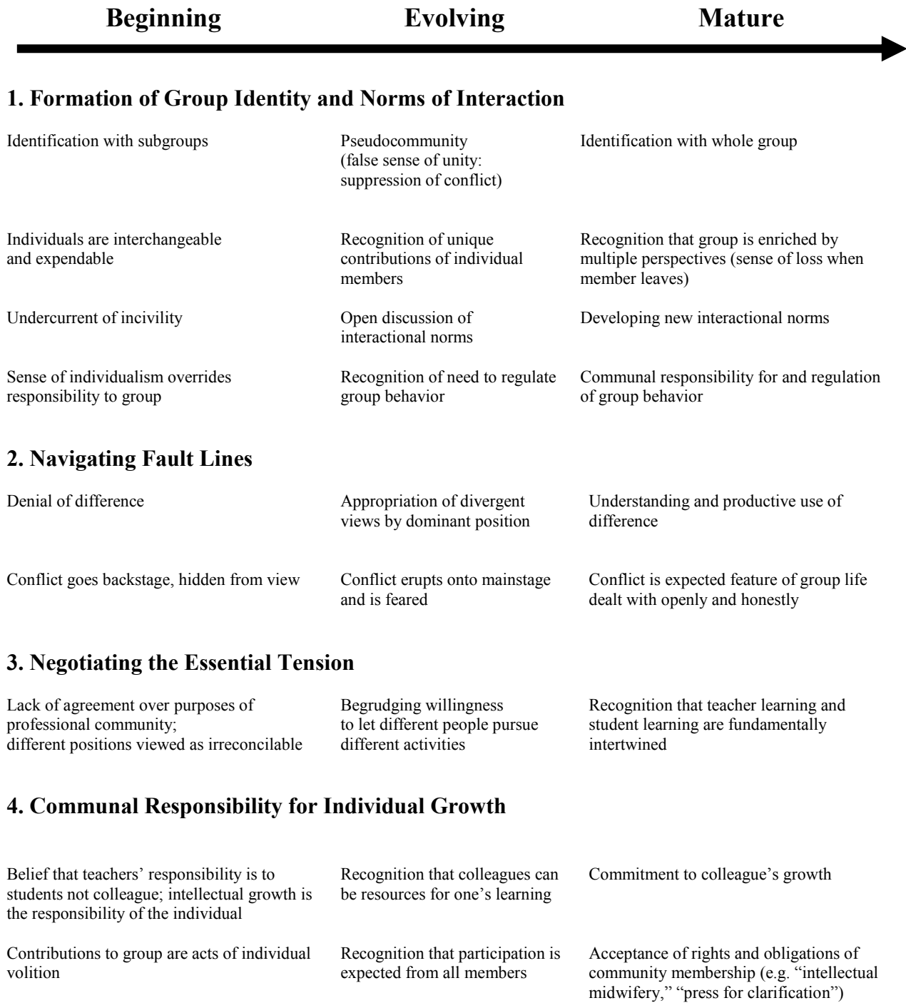
Figure 2: Model of the Formation of Teacher Professional Community